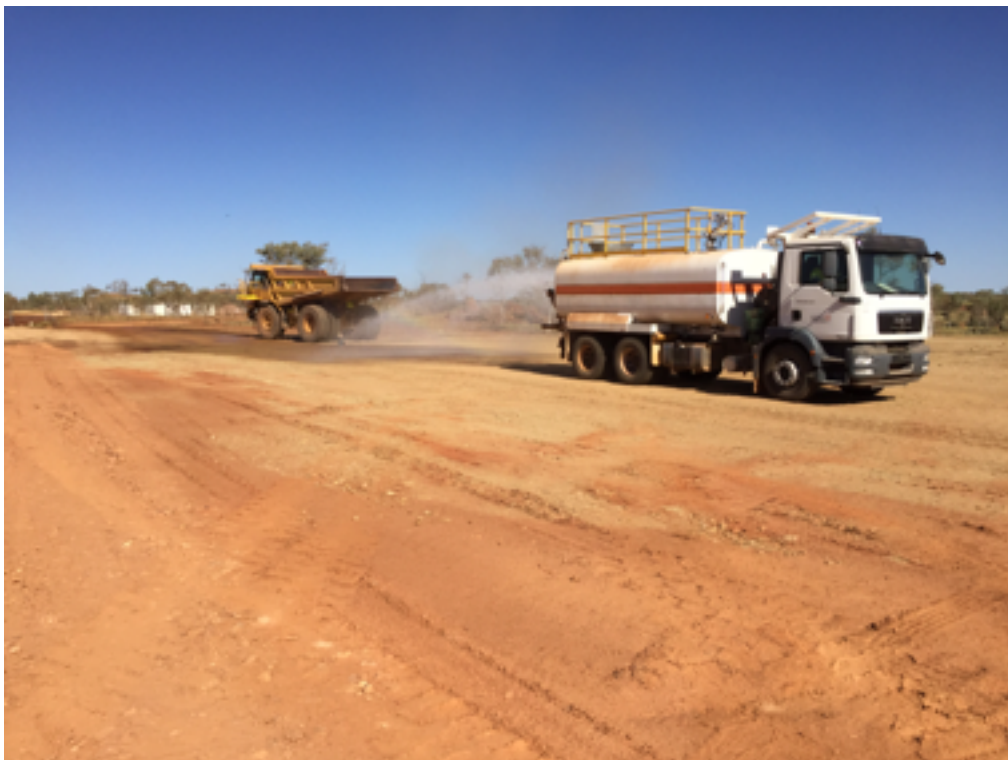
Preparatory Works Begin at Site.

The open pit mining contractors have mobilised to site, and preparatory site works are underway. It is expected that mining will commence in October 2016 as planned, and that ore will be delivered to the processing plant in the first half of the December 2016 quarter. The open pits have an initial life of 9 months, with ore to be blended with underground feed over a period of approximately 16 months.